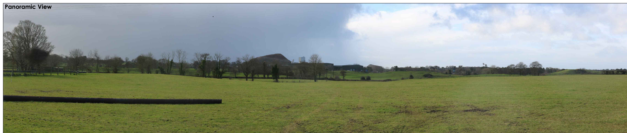
Viewpoint 4 Southwest from L80141. View South from minor road L80141 less than 1km from the subject site. From this open section of road the existing temporary overburden is clearly visible, however areas of proposed extraction would not be visible due to a combination of intervening vegetation and topography.